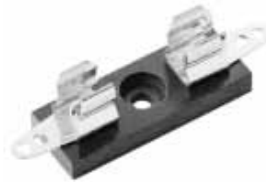
4520 and 4393 Single Pole Fuseblock for 1/4" x 1" Fuses Bakelite base; Width 1/2" (12.7mm). Spring-bronze, bright tin-lead plated clips. Rated 30A, 250V.

Note—Mounting screw hole diameter is 0.147" (3.7mm) Max. Mounting Screw No. 6.