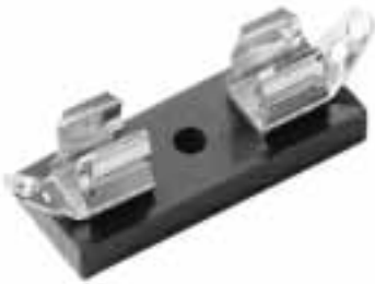
Series 3828 Solder Terminals Fuseblock for 1/4" x 1" Fuses (6.4mm x 25.4mm)